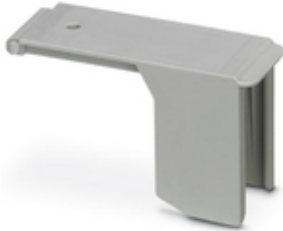
Covering hood, length: 85.6 mm, width: 28.8 mm, height: 46.7 mm, color: gray

Please be informed that the data shown in this PDF Document is generated from our Online Catalog. Please find the complete data in the user's documentation. Our General Terms of Use for Downloads are valid ( http://phoenixcontact.com/download )